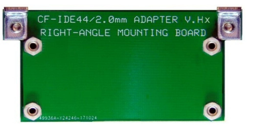
Optional Panel to allow right angle mounting of CF-IDE44 adapter.