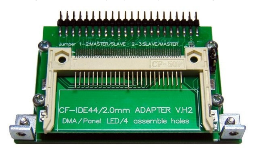
Adapter to convert IDE44 connection to Compact Flash (shown attached to right-angle mounting panel)